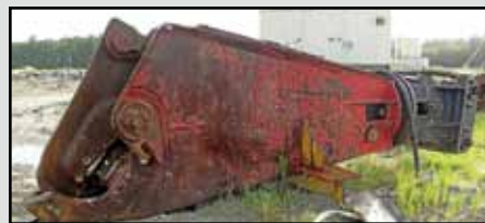
LaBOUNTY SHEAR 70-R