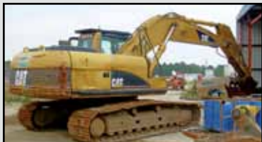
2004 CATERPILLAR 325 CL