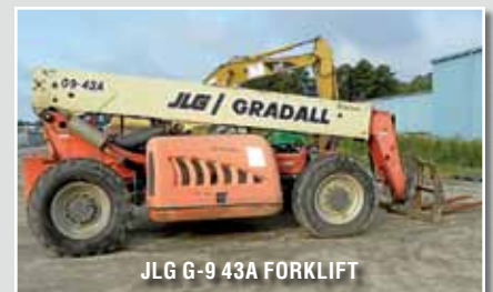
JLG G-9 43A FORKLIFT