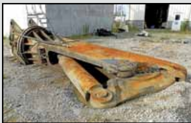
LaBOUNTY SHEAR MSD-100 R

Some equipment will be sold from Florence, SC that is located in Pasadena & Austin, TX, Buffalo, NY and other locations. Please see catalog for actual addresses.