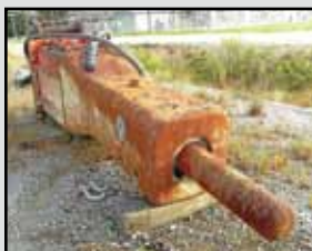
ALLIED G130 BREAKER