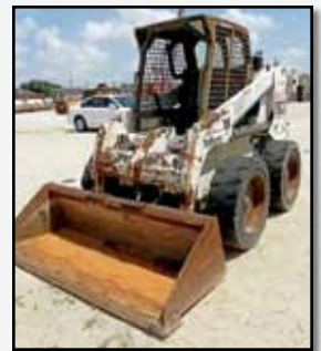
2000 BOBCAT 863 G SERIES SKID STEER LOADER