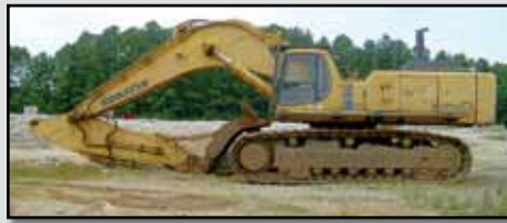
2001 KOMATSU PC 750 LC-6