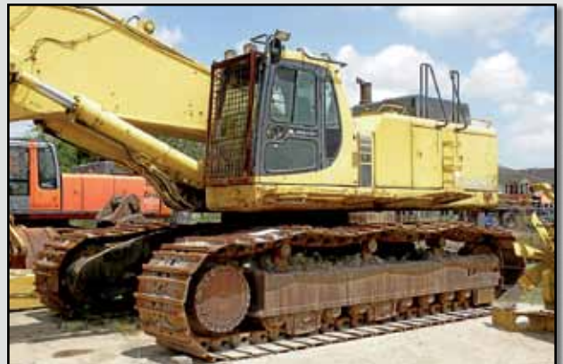
2002 KOMATSU PC 750 LC-6

Some equipment will be sold from Florence, SC that is located in Pasadena & Austin, TX, Buffalo, NY and other locations. Please see catalog for actual addresses.