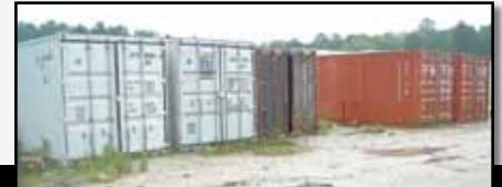
VIEW OF STORAGE CONTAINERS