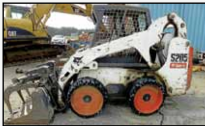
2006 BOBCAT S205 SKID STEER LOADER

Job Boxes, Safety Equipment, Power Panels, Pressure Washers, LEROI Compare Compressor, Storage Containers, & Tools.