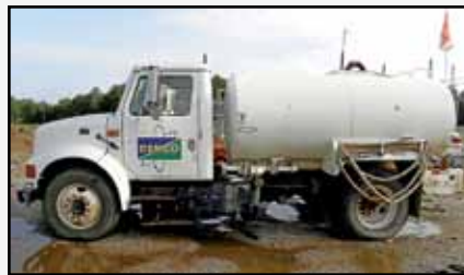
1997 INTERNATIONAL 4700 UTILITY TRUCK W/2003 LEDWELL WATER TANK