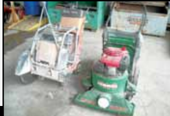
HUSKY CONCRETE SAW & BILLY GOAT VACUUM