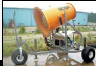
DUST BOSS WATER CANNON/ SNOW MAKER