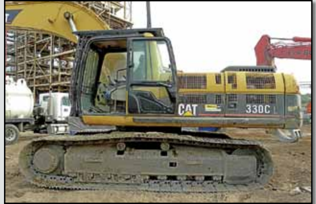
2005 CATERPILLAR 330 CL

2005 CATERPILLAR 330 CL , S/N 03300CVKDD01065, excavator w/34" tracks, 10' 6" stick and no attachments, 6,477 hrs. (Austin, TX)