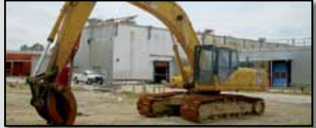
2004 KOMATSU PC 300 LC-7