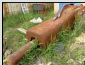
ALLIED G130 BREAKER

PLUS Many More Buckets, Grapples, Pulverizers and Breakers.