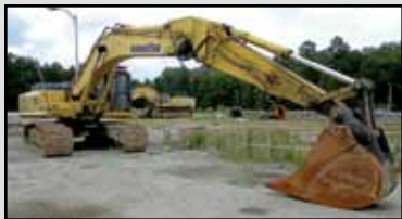
2005 KOMATSU PC 300LC-7