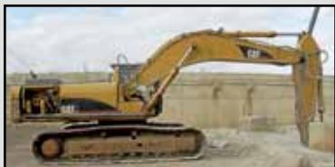
2005 CATERPILLAR 330 CL