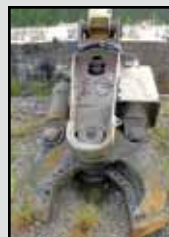
LaBOUNTY SHEAR UP-40