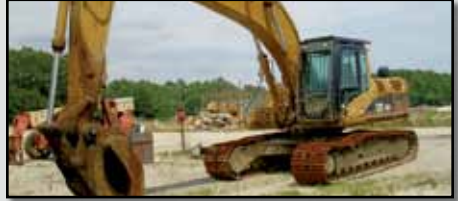
2005 CATERPILLAR 325 CL