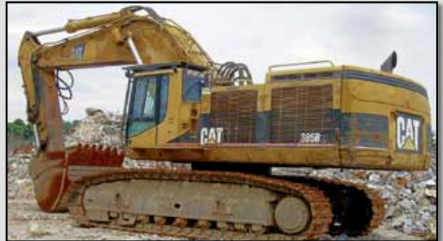
2005 CATERPILLAR 385BL