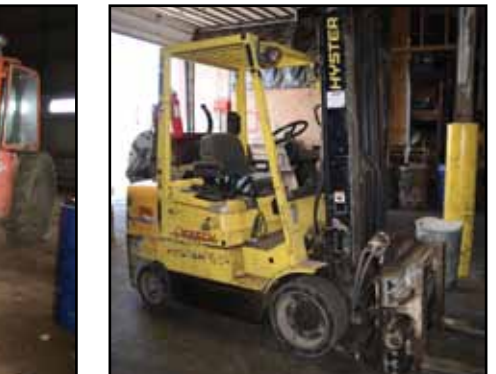
HYSTER S60XM Forklift

Cab, Solid Tires, 17,702 Hours, w/ EVERGREEN Scale System, CAT Bucket, Optional High-Lift System, S/N CAT0966GKANZ00673