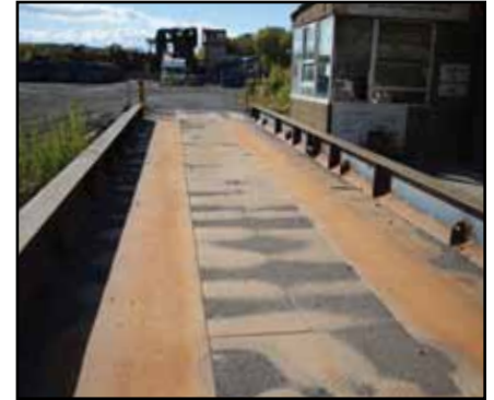
ATLAS 20,000-lb. Capacity (Est.) Truck Scale