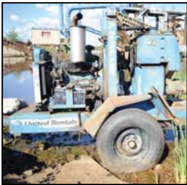
THOMPSON 6" Trash Pump