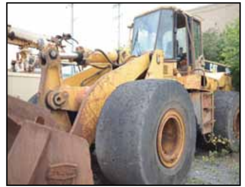
CATERPILLAR 966F II Articulating Rubber Tired Loader