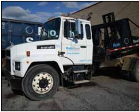
MACK CS300P S/A Dempster Dumpster Container Truck