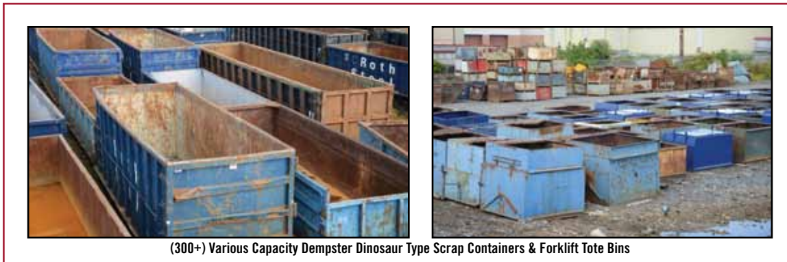
(300+) Various Capacity Dempster Dinosaur Type Scrap Containers & Forklift Tote Bins