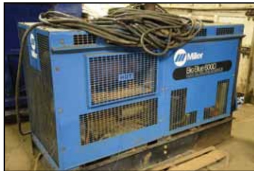
MILLER Big Blue 600D CC/CV DC Welder/Generator