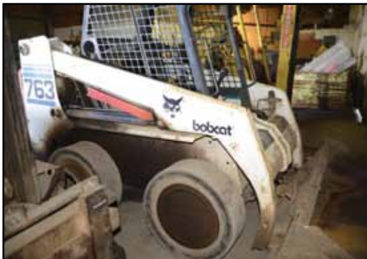
BOBCAT 753 Hyd. Skid Steer