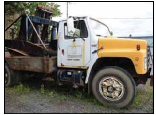
INTERNATIONAL S1954 S/A Dempster Dumpster Container Truck