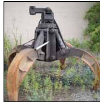
PIERCE 4-Tine Hyd. Demolition Grapple Attachment