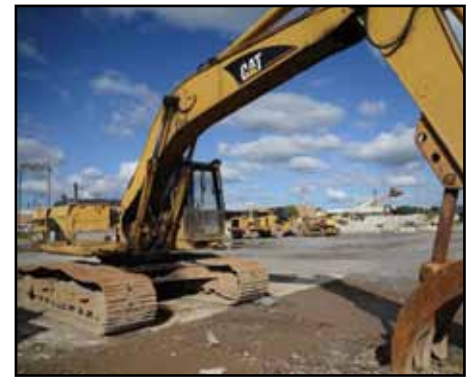
CATERPILLAR 325BL Crawler Excavator