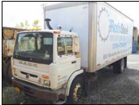
MACK Manager MS300P S/A Cabover Van Delivery Truck