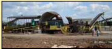
WENDT 48" Eddy Current Separator System