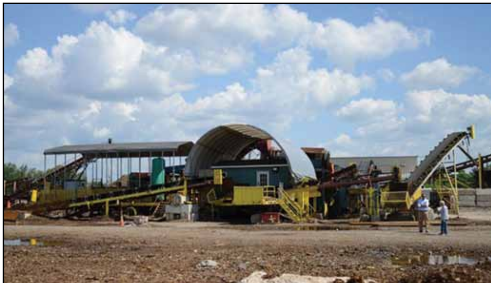
Separates Non-Ferrous Metal From Shredder Waste