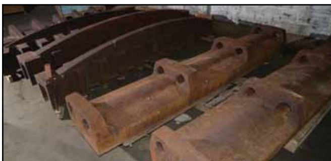
Miscellaneous Parts for Shredder