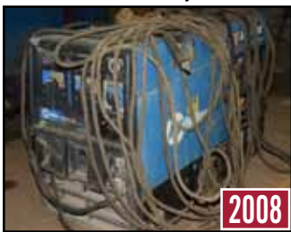
2008 MILLER Bobcat225 CC/CV Welder