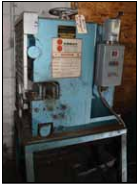
GENSO EQUIPMENT ADDAX Wire & Cable Stripper