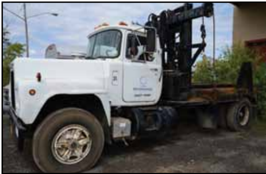
MACK S/A Dempster Dumpster Container Truck