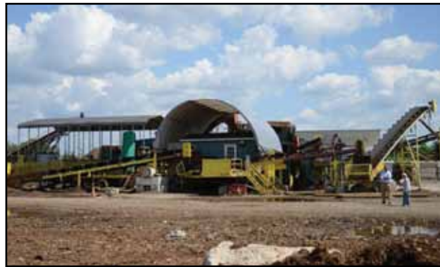
WENDT 48" Eddy Current Separator System