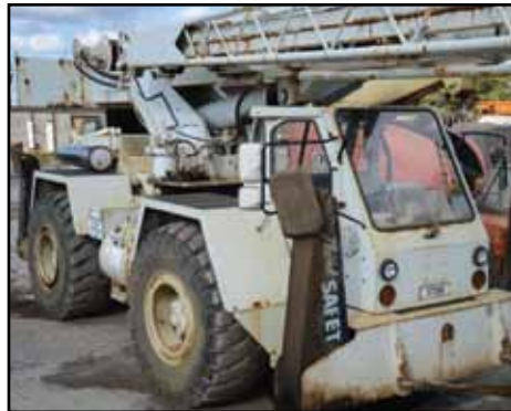
P&H 22-Ton Capacity Rubber Tired Rough Terrain Hyd. Truck Crane