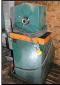
(2) RIGBY 4-H 2" Wire & Cable Strippers