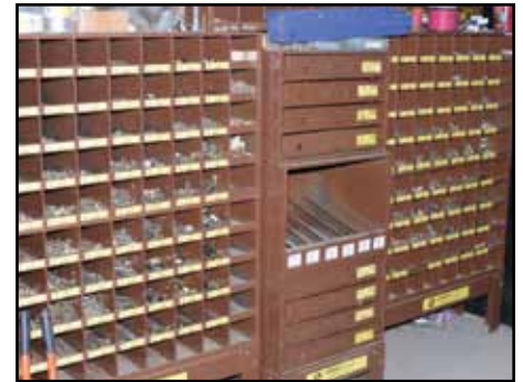
Large Inventory of New & Used Repair Parts