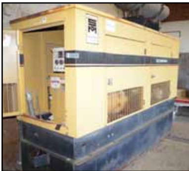
OLYMPIAN/GENERAC 93A-05209S Diesel Stand-By Generator