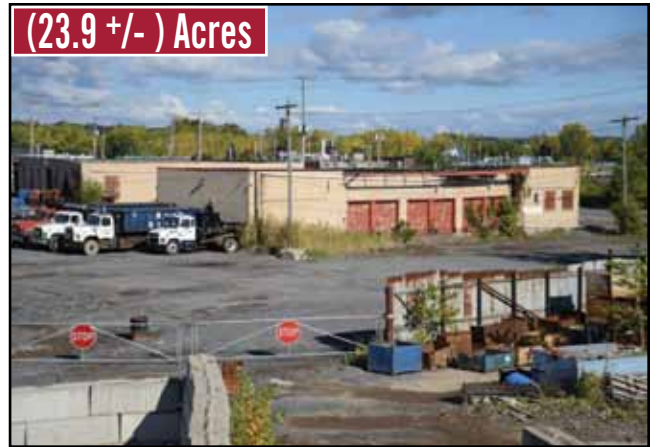
Approx. 23.9 Acres & Real Estate For Sale