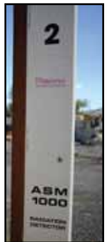
THERMO ELECTRON CORP Radiation Detection System