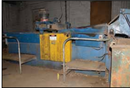
HUSTLER Money Maker Separator / Sorting Table System