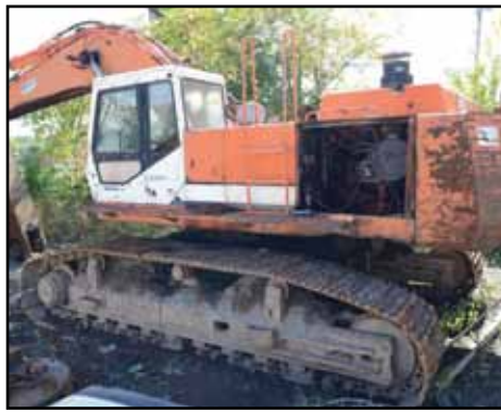
DAEWOO Solar 450-III Hyd. Crawler Excavator