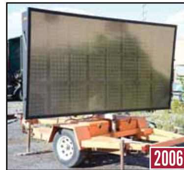
2006 VER-MAC Electronic/Solar Powered Programmable Message Board