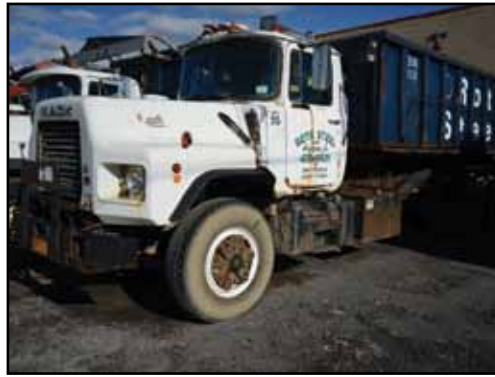
MACK DM690S T/A Container Truck