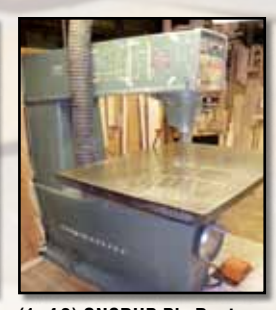
(1 of 2) ONSRUD Pin Routers