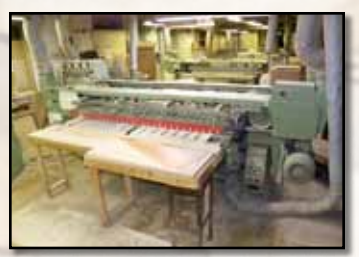
HEESEMANN 6750 Dual Belt Automatic Sander, 8500 x 150 mm belt