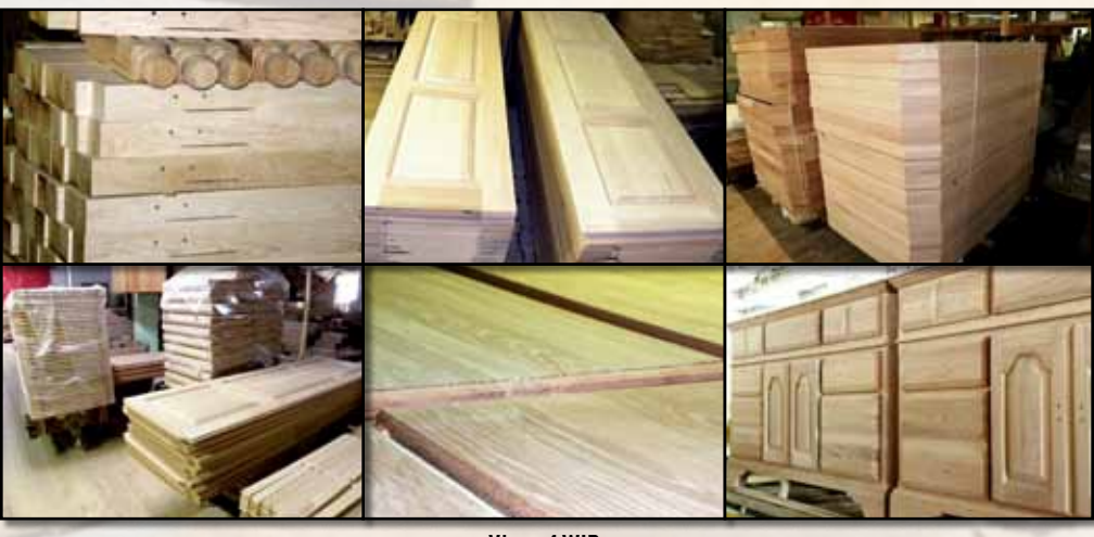
View of WIP

LUMBER INVENTORY: ALL SOLID HARDWOOD—over 100,000 of board-feet of 4/4 and 6/4 maple, cherry, ash, oak, beech and more. Check website for accurate inventory. Lumber will be offered in bulk and piecemeal.