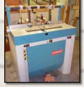
2003 HOFFMAN PP2-32/100-4 Dovetail Router , sn 7.137-6