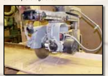
DELTA Radial Arm Saw