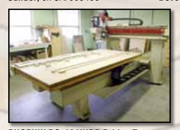
PHOENIX RG-48 XHDR Bridge Type CNC Router, 4' x 8' table