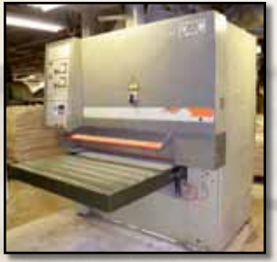
DMC Mdl. Chronosand CN130/2 Sander, sn SA/003438