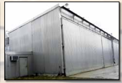
2000 NARDI 150,000 Board-Foot Cap. Timber Drying Kiln, (3) bays @ 50,000 each w/Leonardi controls