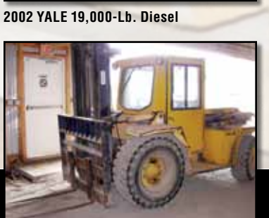
SELLICK 6,000-Lb. Diesel