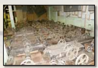
View of factory carts

ALSO: Infeed and Slash Line Conveyors, and Live Deck; 40 Hp Wood Hog; Various Rotary Clamps; Case and Pod Clamps; Air Compressors; Complete Finishing Lines with Conveyors, Pots, Spray Booths, Guns; Various Stroke, Belt, Edge and Profile Sanders; Table, Band, Chop, Radial Arm and Other Saws; Boring Stations; Pin and Multi-Head Routers; Jointer; Dust Collectors; 100's of Factory Carts; Pallet Jacks; and much more.