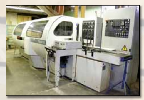
2003 SCMI Topset 23 Molder, sn AA1/011948, 6-head w/BEN-200 feeder, sn MA/003556