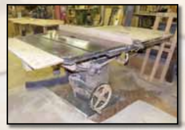
AMERICAN Mdl. 6 Table Saw