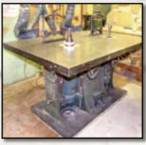
(1 of 2) BAXTER WHITNEY Dual Spindle 1-1/8" 2 Hp Shaper

Complete Furniture Manufacturing Plant for Solid Hardwood Furniture